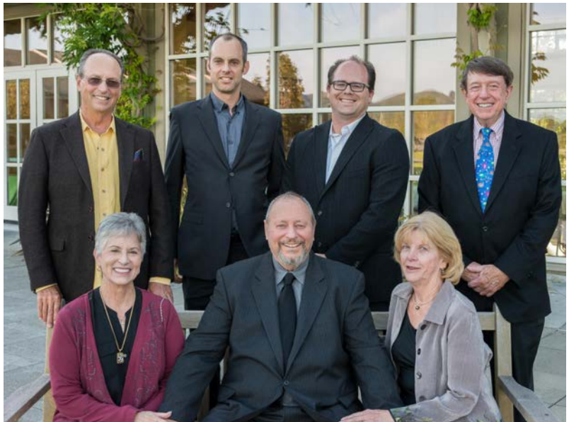
Harbor Point Charitable Foundation ROCKS! Thank you for your steadfast support.